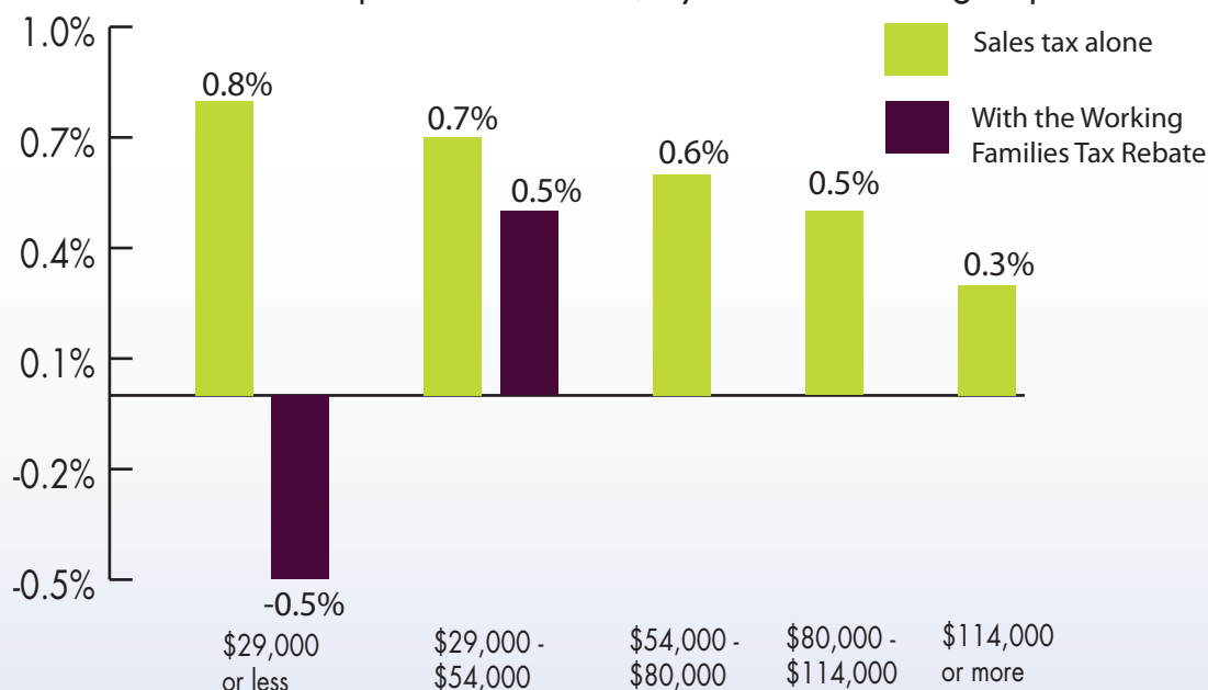
Figure 2: Annual cost of a one-percentage-point increase in the state sales tax as a share of personal income, by 2009 income group