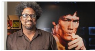
Comedian W. Kamau Bell draw Bell is such a fan of Lee that the Wing Lu... SEATTLETIMES.COM

W. Kamau Bell, comedian and host of United Shades of America on CNN, visited the Wing Luke Museum's Bruce Lee exhibit. Bell told the Seattle Times he draws inspiration from Lee's philosophy. "Judge what everybody else is doing, pick out the parts you want, but then do you."