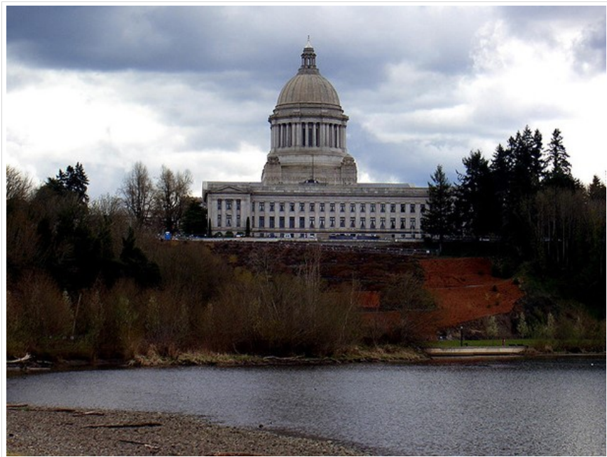
The Legislative Building in Olympia

In Washington, the wealthiest households pay less than 3 percent of their income in state and local taxes. Meanwhile, middle-income families pay around 10 percent and those with the least pay up to 17 percent. This structure is shocking.